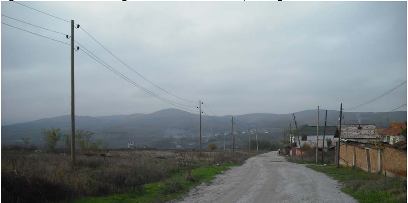
Figure 3.1: View of Shala Neighbourhood and Bardh Mine, Looking West

The neighbourhood is 12.4 ha in size. It is comprised of narrow residential lots, extending east-west along a single unpaved roadway ( Figure 3.1 ). Houses, often grouped in walled compounds, are located closest to the road with residential extensions, outbuildings, gardens and agricultural and grazing lands further north. Over time, properties have subdivided within families. Nearly all resident families are related and have the last name Shala.