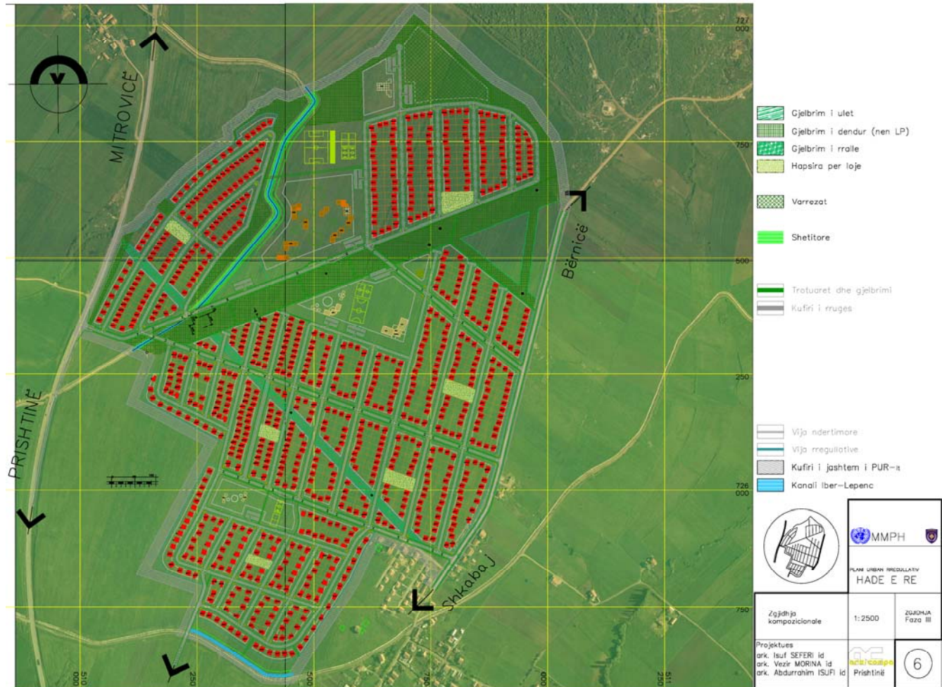
Figure 7.1: Community Plan for the Resettlement Village

The 44 ha Shkabaj site, as identified by KEK, MESP and the Municipality of Obiliq, will serve as the location for the resettlement of physically displaced households during several phases of mine expansion in the New Mining Field, beginning with the Shala neighbourhood resettlement program. Approximately 250 plots will be developed as part of this first phase. At full build-out, the new community at Shkabaj will comprise approximately 1,000 urban plots, school and kindergarten, health centre, mosque, cemetery and sports and recreation areas.